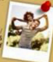
SPINE / SCOLIOSIS SURGERY