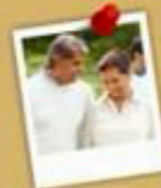
ROBOTIC KNEE, HIP & SHOULDER REPLACEMENT